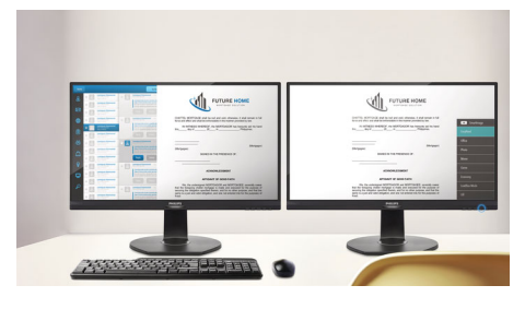
EasyRead mode for a paper-like reading experience