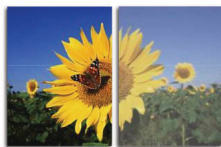
With SmartImage Without SmartImage

SmartImage is an exclusive leading edge Philips technology that analyzes the content displayed