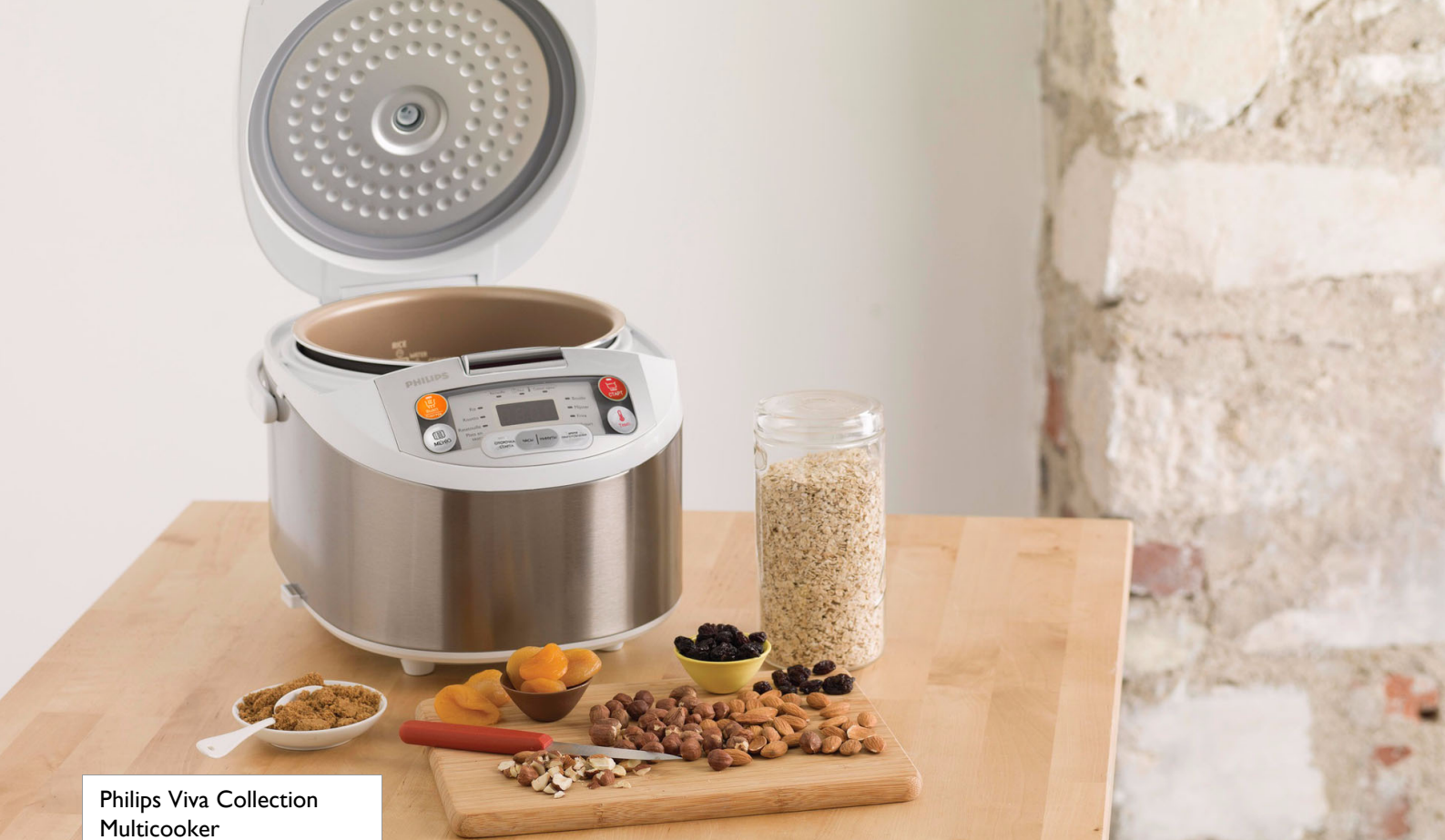
Philips Viva Collection Multicooker