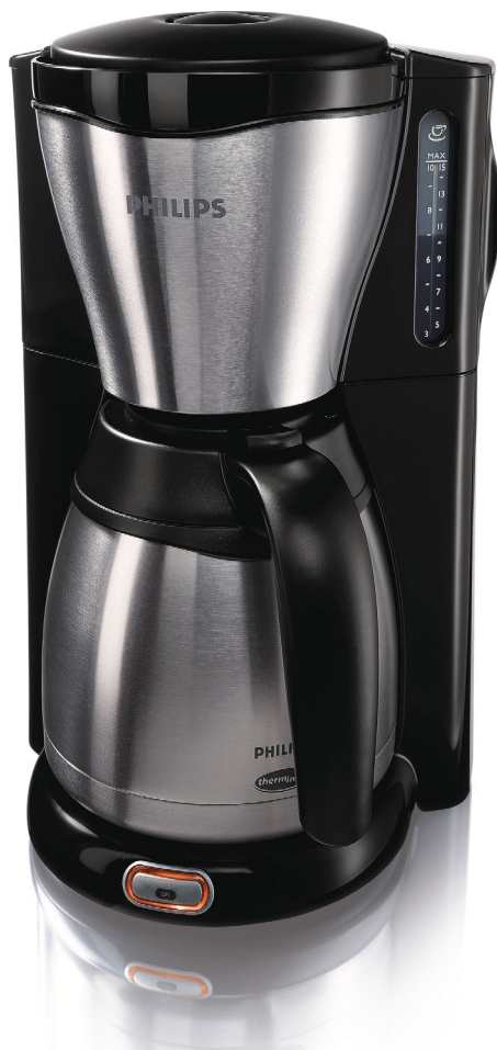
Philips Coffee maker