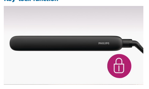
The plates can be locked together for safe and easy storage.