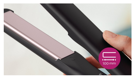
The longer 100mm plates enable better contact with the hair to help you achieve perfect straightening results easier and in less time.