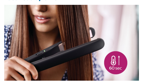
The straightener has a fast heat-up time, being ready to use in 60 seconds.