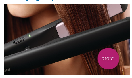
This high temperature enables you to change the style of your hair to achieve the look you want.