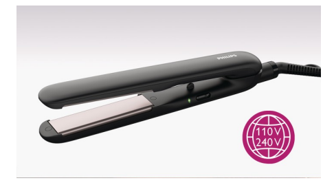
Compatible with 110-240 volts. Can be used wherever you travel in the world.