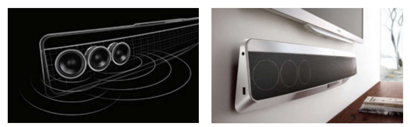
Precisely angled drivers to ensure embracing multi-channel surround sound.