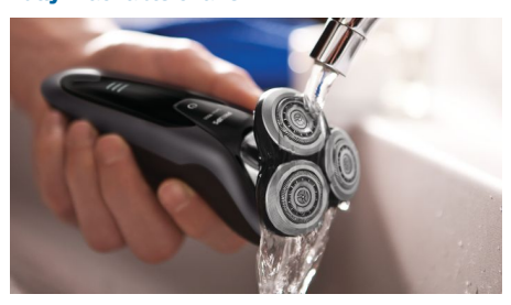
Simply open the shaver head to rinse it thoroughly under the tap.