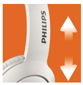
Designed for optimal fit, BASS+ headphones feature swiveling earshells and an adjustable headband to ensure a great fit for all wearers.