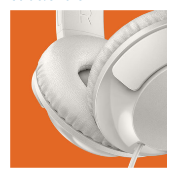
Soft, breathable ear cushions provide great comfort over long listening sessions.