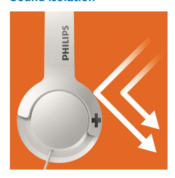
With a closed acoustic design, BASS+ headphones block out ambient noise to create improved sound isolation for a better listening experience.