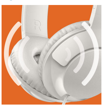
This is big, powerful bass that lets you really feel the beat. Don't let the sleek design fool

you – specially tuned drivers and bass vents produce ultra-low end frequencies to create a unique BASS+ sound signature.