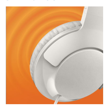
BASS+ headphones feature 32mm speaker drivers that produce big, pumping bass.